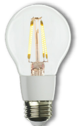
A19 Clear LED7A19/27K/FIL/D