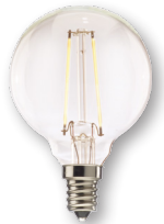
G16 Clear LED2G16/27K/FIL/E12